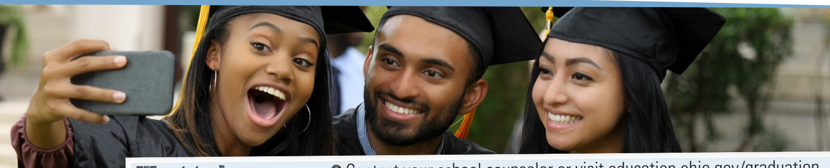
Vant to learn more? Contact your school counselor or visit education.ohio.gov/graduation