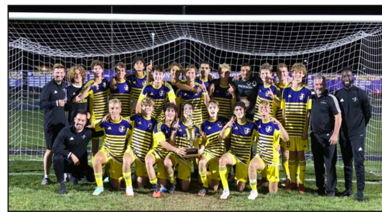
The boys soccer team won the Federal League and advanced to the regional championship game. The Polar Bears were Federal League champs.

Our overall fall sports record was 76-18 and 42-6 in the Federal League. We were one of five schools in Ohio to have volleyball, both soccer teams advance to the regional tournament and win a football playoff game. We were the only school in Ohio to have girls golf and both cross country teams made it to the state tournament, win a football playoff game and get both soccer teams and the volleyball team to the regional tournament.