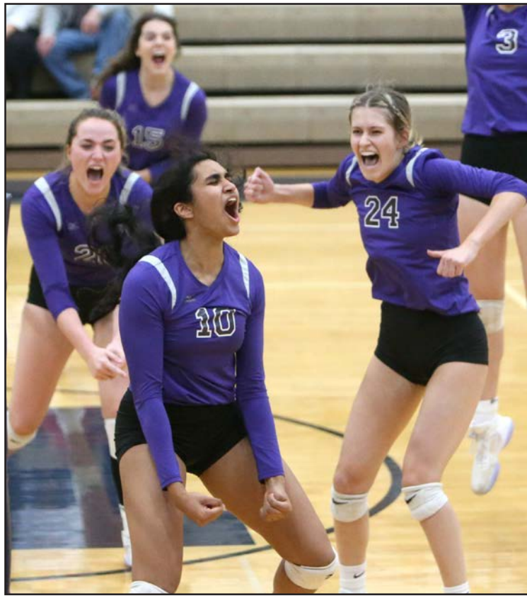
The Jackson volleyball team celebrates a hard-earned point in a regional tournament match. The Polar Bears won the Federal League.

Our boys and girls cross country teams won Federal League championships and then