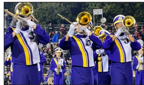
Members of the "Purple Army" Marching Band at Jackson High School perform during pregame of a Polar Bear football game.

Our fall sports team finished the All-Sports Trophy Federal League Standings with a 15.5-point lead in the All Sports Trophy race.