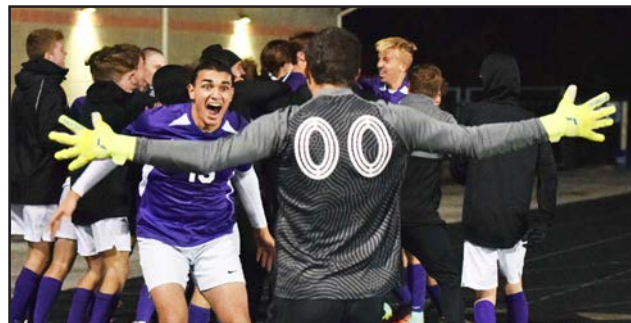
Members of the Jackson High School boys soccer team celebrate a championship. The Polar Bears were one win shy of getting to the state soccer championships