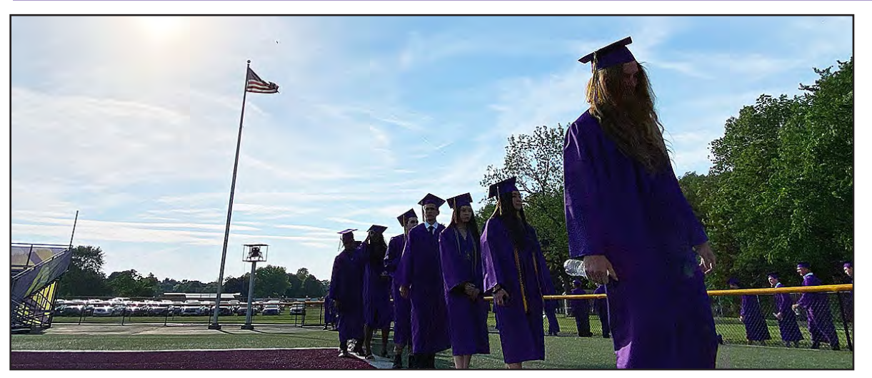
More than 430 members of the Class of 2021 march into Robert Fife Stadium for the processional during the May 25 commencement.